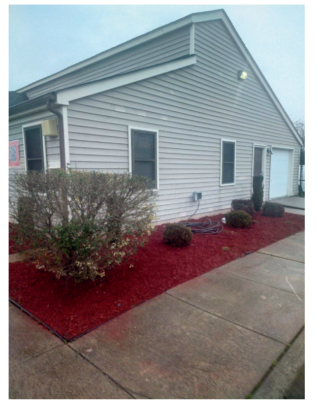
We sincerely thank our Lawn Crew for their outstanding work and dedication in giving our properties such a beautiful makeover this spring!

Properities pictures from left to right: Park Court, Lincoln Homes, Walnut Street School Apartments, and West Haven.